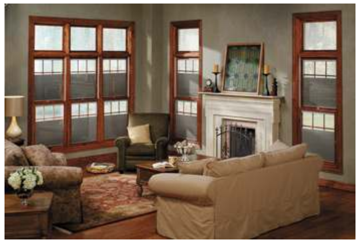
Source: <u>https://aamanet.org/pages/understanding-indoor-condensation</u> Last updated 8/21/2018

For skylights, which reside in the higher parts of the building, exposure to condensation is more likely due to the tendency of warm air (with greater capacity to hold moisture) to rise to the ceiling.